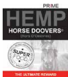
Tasty Hemp Nuggets 1lb - $13.95