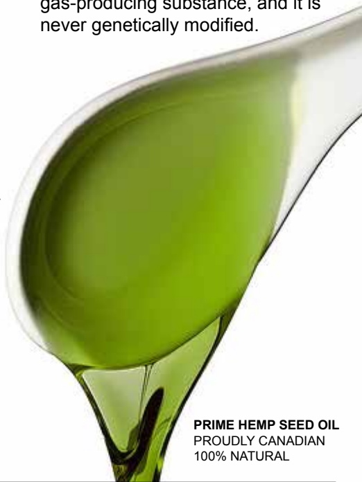
PRIME HEMP SEED OIL PROUDLY CANADIAN 100% NATURAL

fatty and amino acids required for optimal health. Unlike soy and other legumes that can cause gas, hemp does not contain trypsin inhibitors and oligosaccharides, a gas-producing substance, and it is never genetically modified.