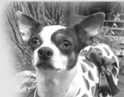
4 year old Purebred Chihuahua - Lila

"For over a half-century, our animal companions have been fed inappropriate diets that have kept them alive, but not thriving. In fact, we've created dozens of generations of animals that suffer from degenerative diseases linked to nutritional deficiencies."