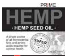
Prime Hemp Seed Oil 500ml - $13.95