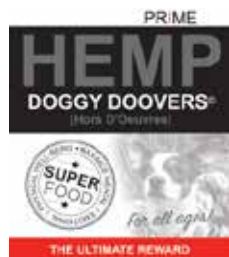
Tasty Hemp Nuggets 8oz - $9.95