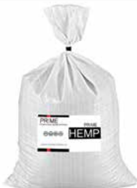
Prime Hemp Protein 10lb - $39.95